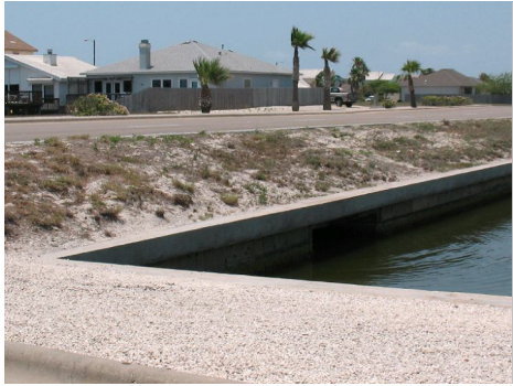
Unimproved canal end