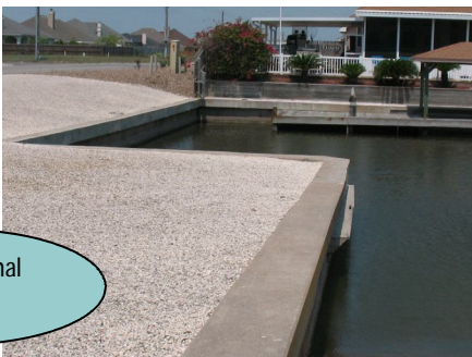
Improved canal end