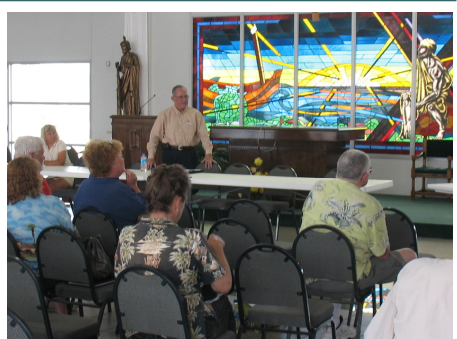
Over 91 property owners attended "How to Protest Your Property Taxes" Town Hall Meeting; City and County officials were also available to answer questions.